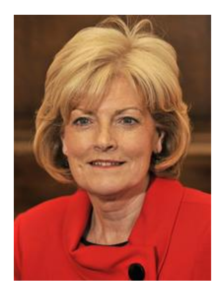
CABINET MEMBER – TRANSFORMATION AND RESOURCES

CABINET MONDAY, 7 MARCH 2016 2015/16 QUARTER 3 CORPORATE PLAN PERFORMANCE MANAGEMENT REPORT